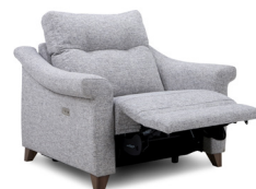
Recliner Snuggler (Manual/Power available)