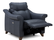
Recliner Chair (Manual/Power available)

All measurements are approximate and relate to the overall size of the item including soft arm cushions where fitted and back cushions. All furniture supplied on show wood legs as standard. Recliners are available in manual or power versions. The power versions have touch buttons and a USB charging port. Contrast stitch available on selected leathers. Large and small double recliner sofas are delivered in two sections that link together. Seat cushions and back cushions are non-reversible. Our recliner furniture requires room to recline. Scatter cushions are available at extra cost.