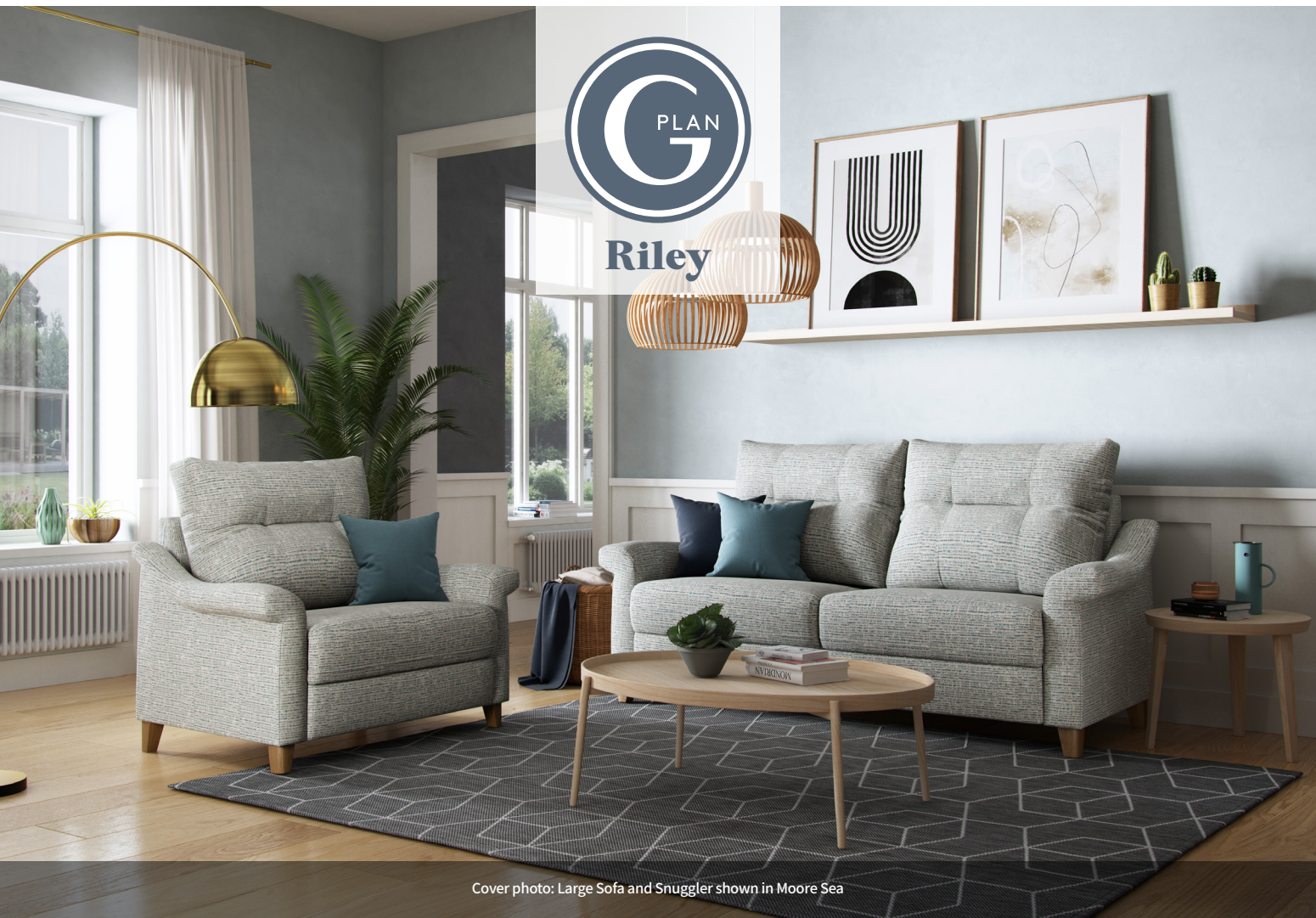
Cover photo: Large Sofa and Snuggler shown in Moore Sea