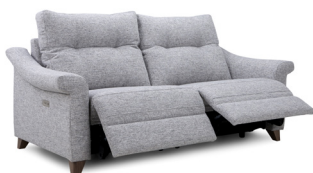
Large Double Recliner Sofa (Manual/Power available)